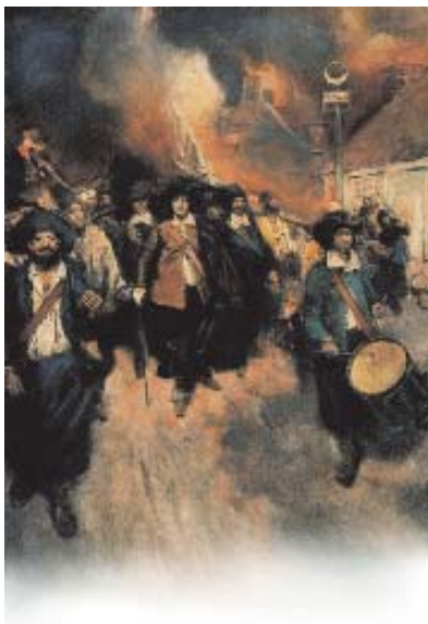
Section 4 The Southern Colonies 85

Explain Problems How did the interests of frontier settlers differ from those of colonists in towns and on plantations?