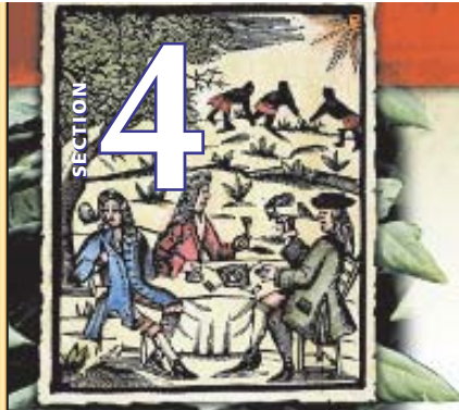
▲ Virginia planters feast as their slaves harvest tobacco.

✓ Checkpoint The climate provided a long growing season that farmers used to raise tobacco and rice. Both of these crops required many workers in the field.